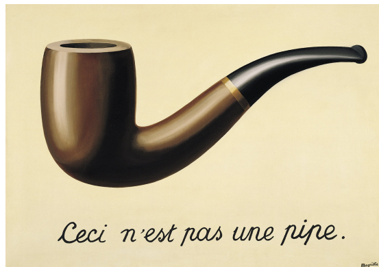
Figure 1.1: A Picture of a Pipe

It can be nice to include figures already in this first chapter. A picture of a pipe is given in Figure 1.1. Also cross-references are used if you want to jump directly to the conclusion in section 5.