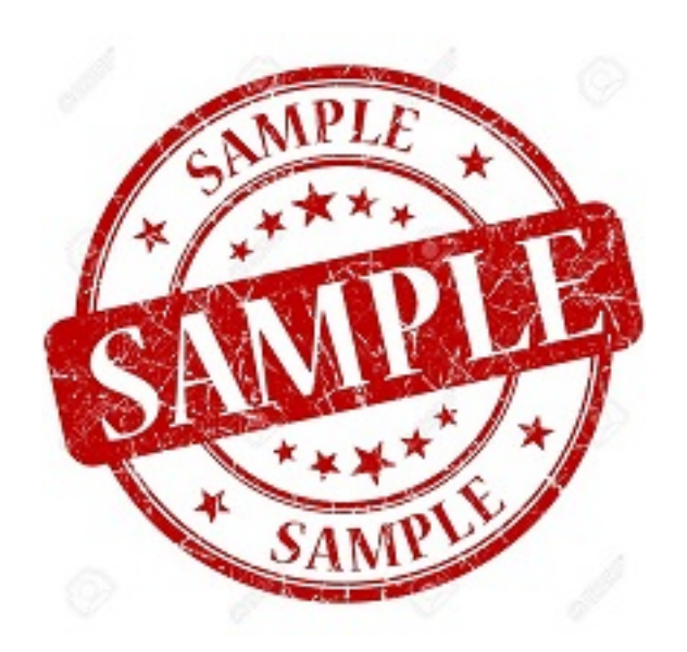
Figure 3-1: Sample Diagram 1

"References" tab and select "Figure" in the dropdown list. Click "Update Table" to update the List of Figures.