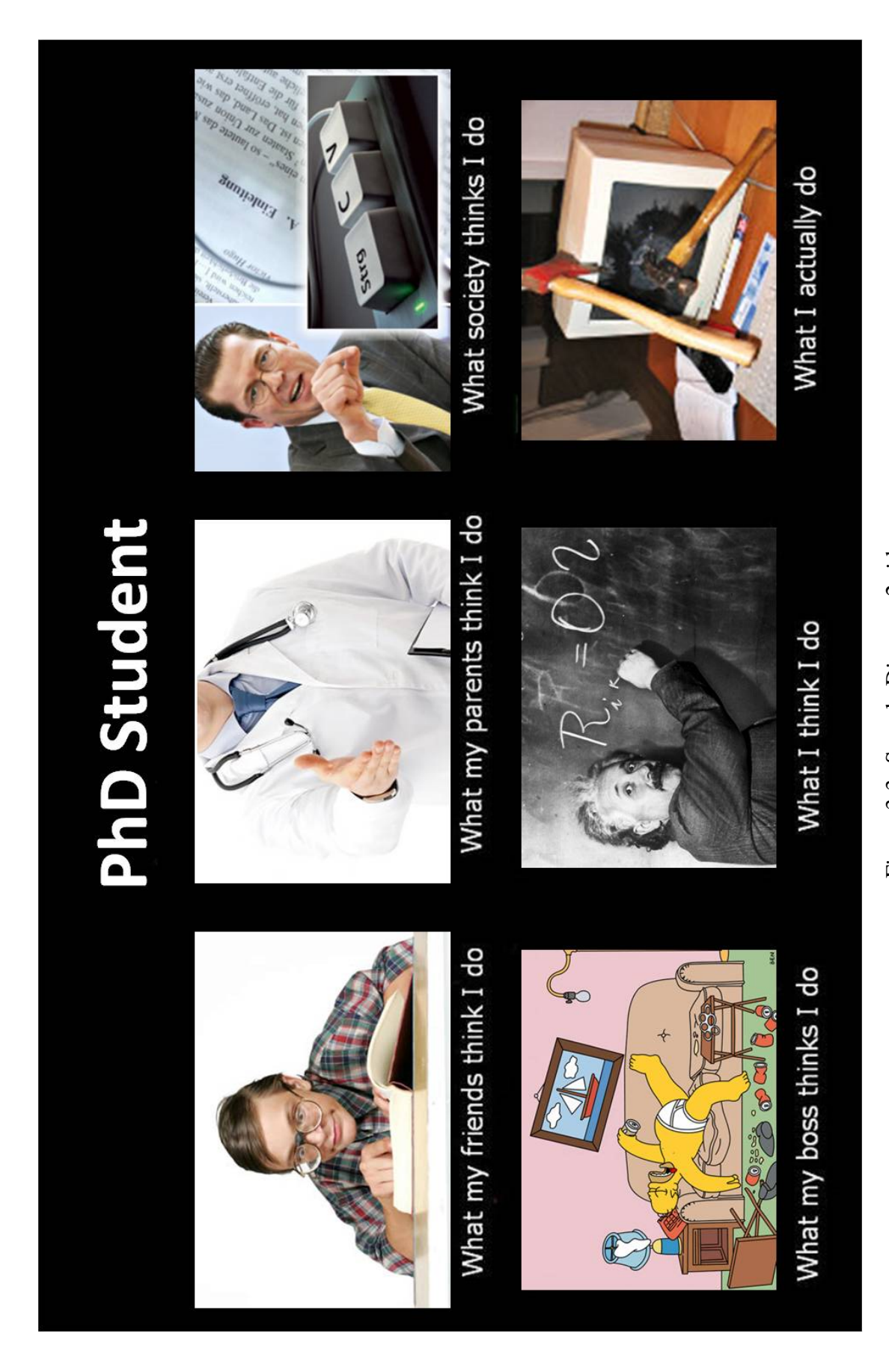
Figure 3-3: Sample Diagram 2 sideways