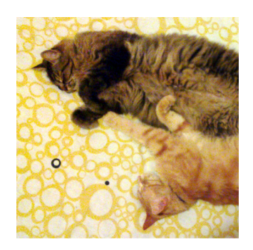
Figure 2: In this image, the cats are tessellated within a square frame. Images should also have captions and be within the boundaries of the sidebar on page 2.