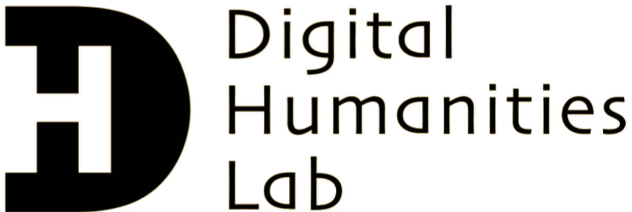
Figure 1: Logo of the DH Lab

This is how an image is inserted into the document: