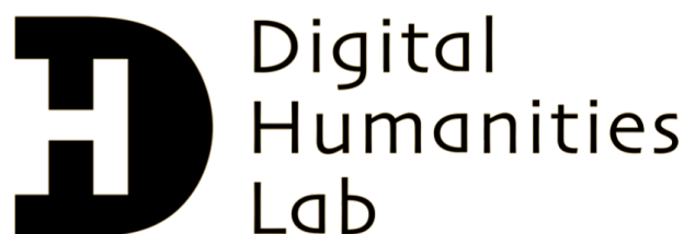
Figure 2: Logo of the DH Lab, but smaller

As you can see, images with captions are numbered automatically. Like with tables, it is possible to generate a list of figures at any point of the document. To do this, use the command \listoffigures :