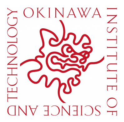
Figure 3.1: Short caption (if wanted). Full caption with all the details here.