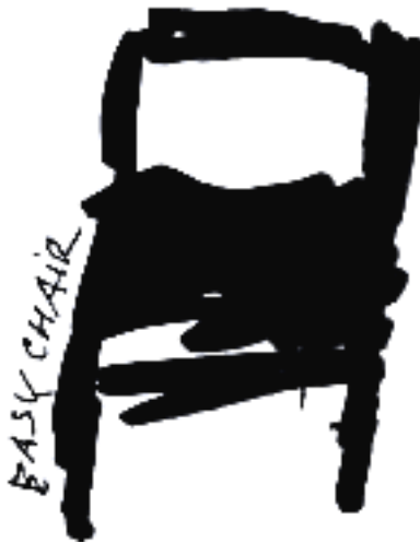
Figure 2: Easy Chair