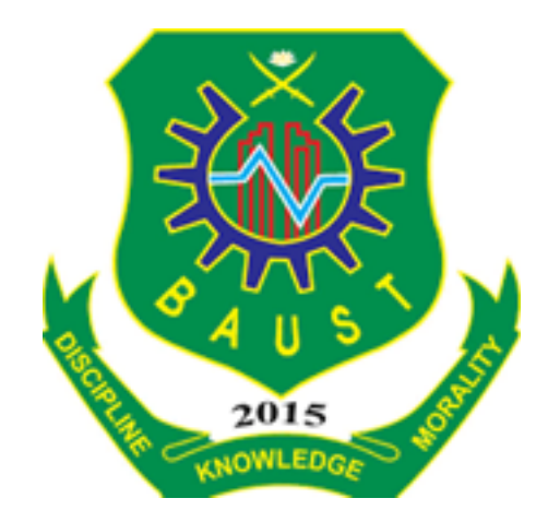
Figure 1.1: Logo of Bangladesh Army University of Science and Technology.

Conclude the introduction by briefly describing the organization of the thesis. Mention what readers can expect in each chapter.