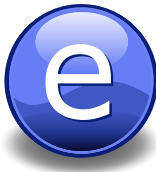
Figure 2.1: An electron (artist's impression).

There are some additional commands created to keep the formatting separated from the content, which we document below.