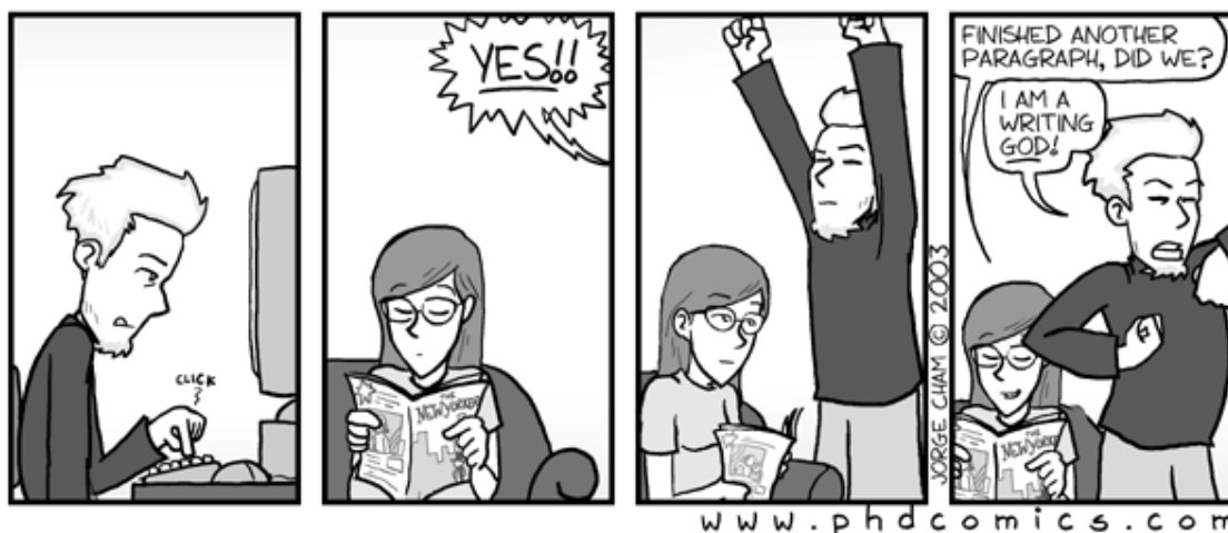
Figure 2.2: A Thesis Writing Comic (from www.phdcomics.com ).

keyword – Used to highlight keywords. For example, this is somekeyword (the command that produces this output is \keyword{somekeyword} ).